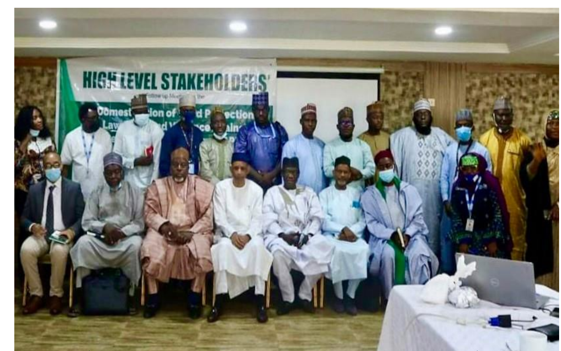
High-Level Advocacy Meeting with the Executive Governor of Yobe State. 2022