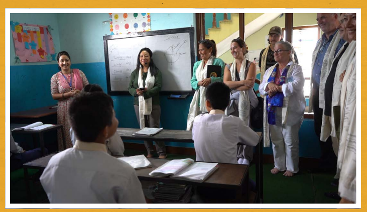
The delegation meets with students at Good Weave's Hamro Ghar shelter home.