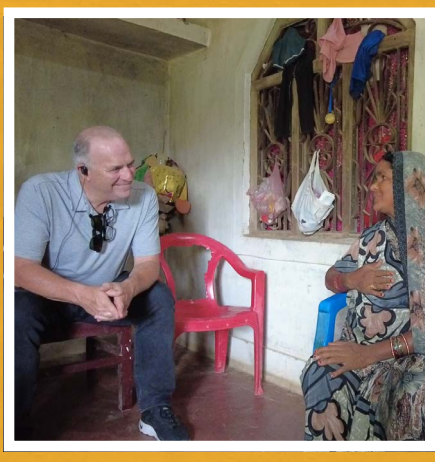
The delegation spends the morning with adolescent girls from CARE's UDAAN and Tipping Point programs.