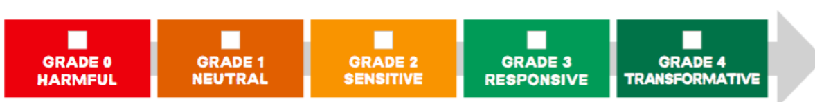
Figure 1: CARE Gender Continuum

The CARE Gender Marker is an accountability and learning tool that monitors, on a 0-4 scale, how well gender has been integrated into the approach of humanitarian and development work. The grading scale places work directly along the CARE Gender Continuum.