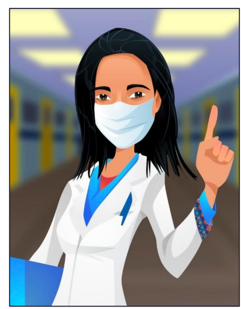
CARE Guatemala's videos on the COVID-19 vaccine are available in 5 languages