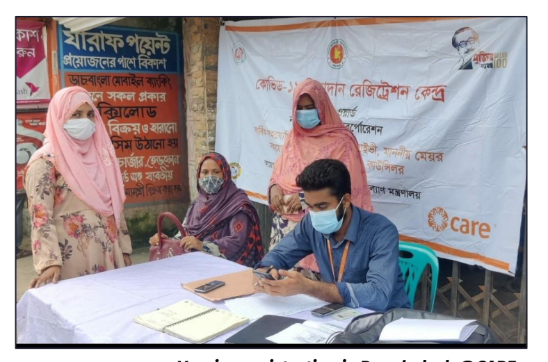
Vaccine registration in Bangladesh @CARE

How did CARE do it? The vaccine registration system is fully online in Bangladesh, and the CARE team helped people who do not have access to smart phones or digital literacy to register online, and to help them follow up and make sure they make it to their vaccination appointments. We hosted education sessions for over 16,000 people (> 60% women) in communities to get people the information they needed to trust vaccines, and organized door-to-door visits for nearly 45,000 people (64% women) to build trust in the vaccines. CARE also supported 650 government health workers (like health inspectors) so they can strengthen vaccine deployment and make sure the system is working. CARE trained 900 volunteers to support vaccine registration and community awareness.