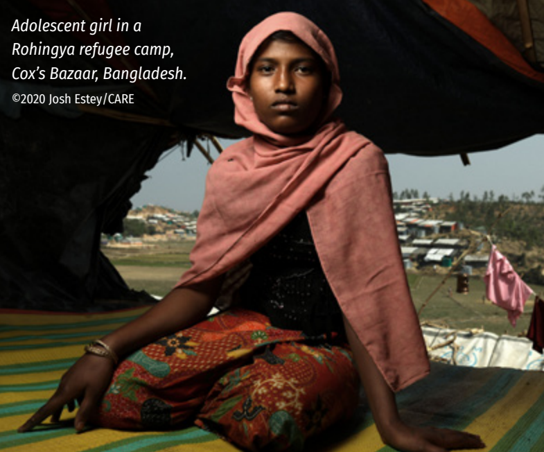
Adolescent girl in a Rohingya refugee camp, Cox's Bazaar, Bangladesh.

“Sexual harassment has a negative impact not only on survivors, but also on the work environment for everyone. I strongly support laws & policies to prevent violence and sexual harassment in the workplace.”