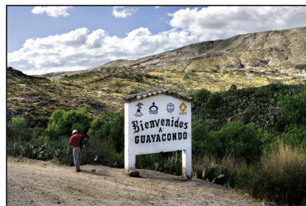
The delegation is welcomed to Guayacondo Village.