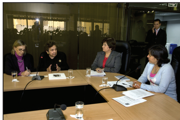
The delegation meets with Nidia Vilchez (far right), Minister of Women and Social Development in Lima.

At the Perinatal Institute of Lima, CARE provides technical assistance and training and collaborates with health facilities located throughout the country. The Institute uses technologies like telemedicine, an audio-visual system of high-definition cameras that connects the institute with hospitals located in distant regions. In this way, experts from the institute are able to provide guidance, training, and supervision to other health facilities. As Secretary Donna Shalala said after visiting the telemedicine room that connected doctors at the Perinatal Institute into the neonatal intensive care unit in Ancash, "This is the future."