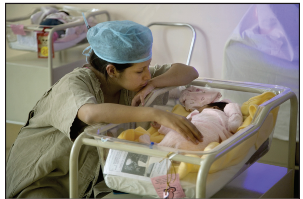
A woman with her newborn infant at the Ayacucho Regional Hospital.

What the experience of CARE in Peru shows us is that the interventions exist to reduce preventable maternal deaths in a relatively short period of time (since 2000). The multi-layered strategies of the FEMME program have increased the met need for emergency obstetric care services and reduced maternal mortality. The combination of training, an approach that considers rights and cultural sensitivity, and staff commitment has helped increase the number of institutional births. This has ultimately saved the lives of women in rural Ayacucho – improving their lives and that of their families and communities.