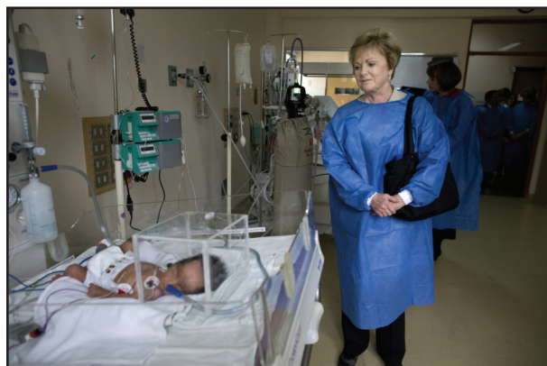
Congresswoman Granger looks in on the Neonatal Intensive Care Unit at Dos de Mayo Hospital.