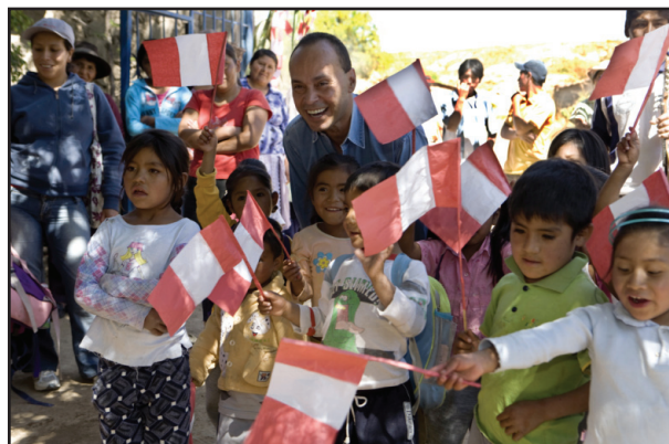
Congressman Gutierrez is welcomed to the village of Neque.

An intercultural approach is more than language. It also includes a respect for local tradition, including the appropriate color for bed sheets and walls. For example, all of the white sheets were stripped off the beds and replaced with pink sheets because the color white is associated with death. Other approaches include types of food and drink typically consumed during delivery, and even the position of a woman's body during delivery. Indigenous women in the Andes often prefer squatting, or what is called a vertical birth. During the FEMME program, medical staff were trained (technically and socially) in providing care for women who opted for a vertical birth. At the HRA, about 15 percent of births are vertical – a number which continues to increase each year.