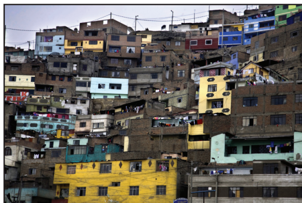
San Cosme, a slum in Lima that has the highest rate of tuberculosis in the area.

Issues of poverty and poor health, although heavily concentrated in rural communities, are not isolated to the most remote areas in Peru. The delegation saw the glaring realities for Lima – a city of about nine million people – in the poor, urban community of San Cosme. San Cosme is often characterized as an urban slum with houses zigzagging over and across hillsides and valleys. Its narrow streets are cluttered with pedestrians, cars, motorcycles, and bicycles crisscrossing at often frighteningly close proximities. San Cosme is known for having the highest incident of tuberculosis (TB) in the city and is where CARE and The Global Fund support a small health facility. Located just a short walk from the local market, the San Cosme Health Center is already busy at 8 a.m. with expectant and new mothers as well as many TB patients.