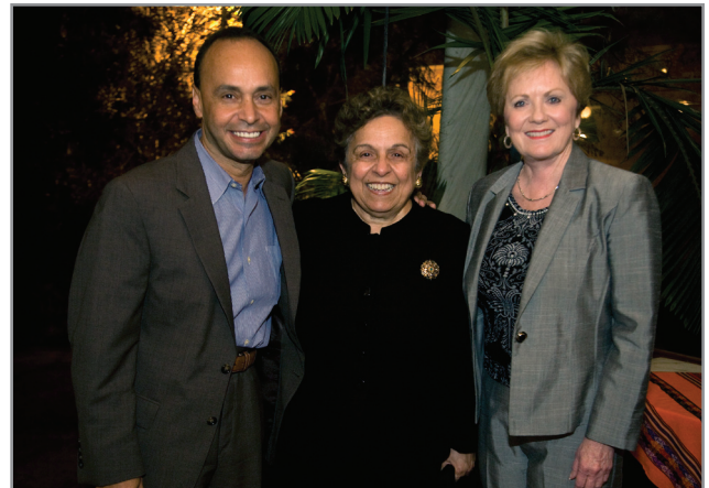
From left to right: Congressman Luis Gutierrez, Secretary Donna Shalala, and Congresswoman Kay Granger.

Communications and Knowledge Manager of Health for CARE