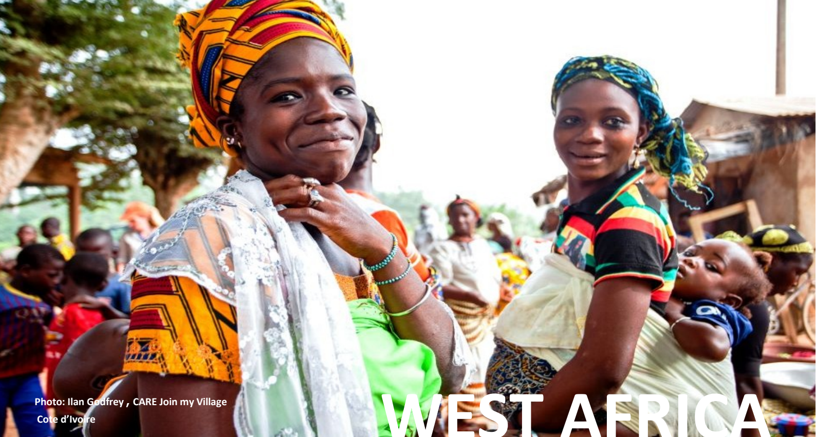
Join my Village Cote d'Ivoire