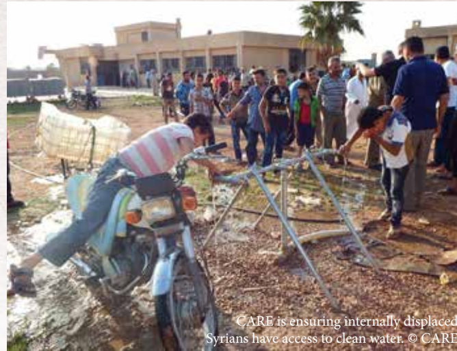
CARE is ensuring internally displaced Syrians have access to clean water.