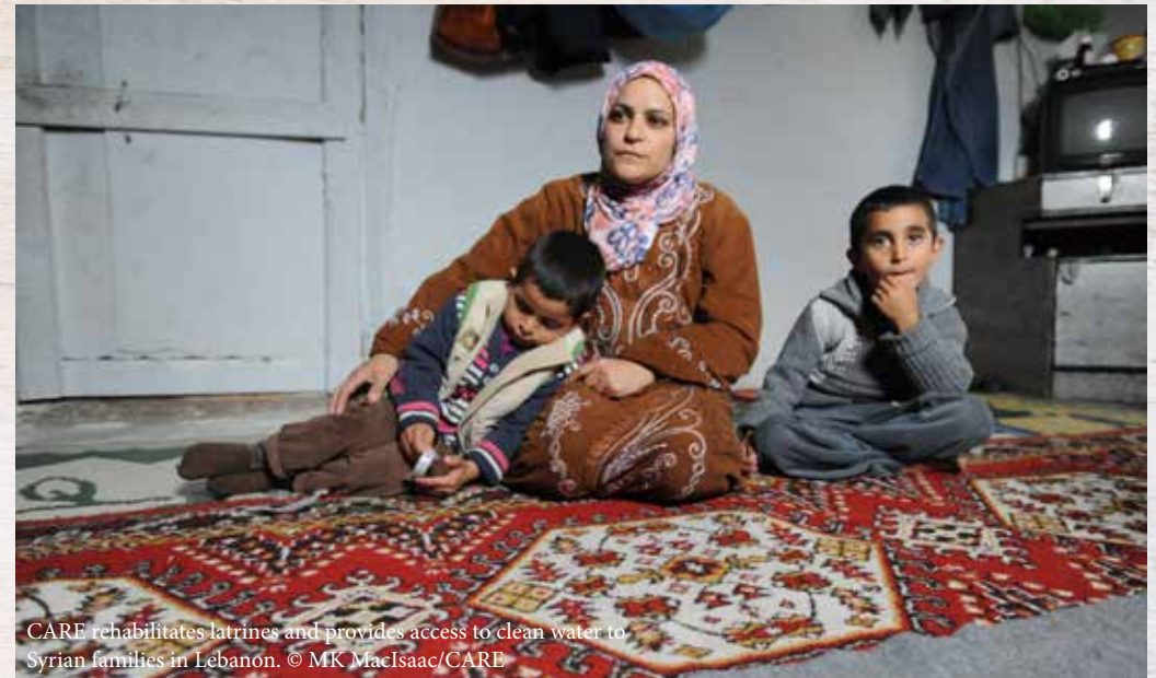
CARE rehabilitates latrines and provides access to clean water to Syrian families in Lebanon.