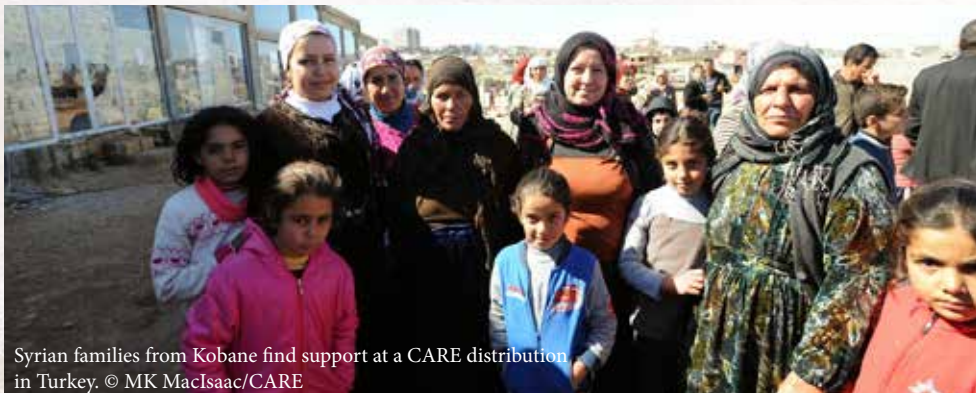
Syrian families from Kobane find support at a CARE distribution in Turkey.