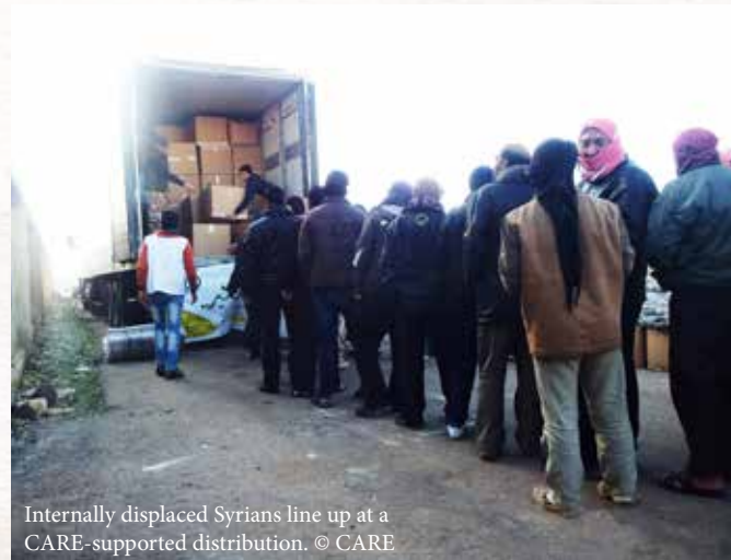
Internally displaced Syrians line up at a CARE-supported distribution.