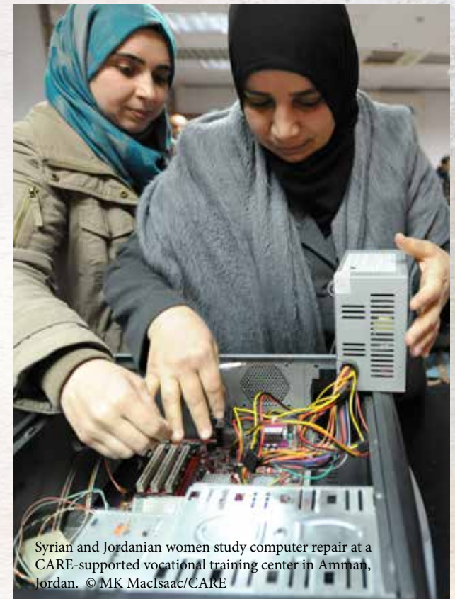
Syrian and Jordanian women study computer repair at a CARE-supported vocational training center in Amman, Jordan.