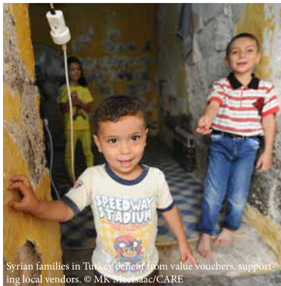
Syrian families in Turkey benefit from value vouchers, supporting local vendors.