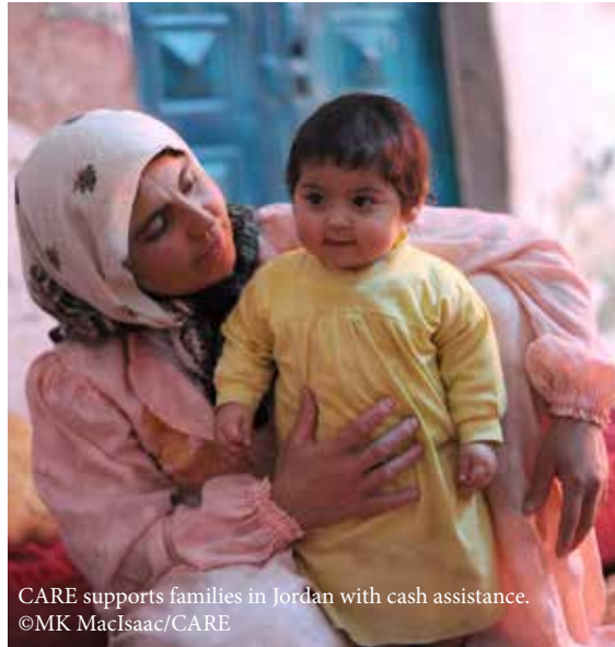
CARE supports families in Jordan with cash assistance.