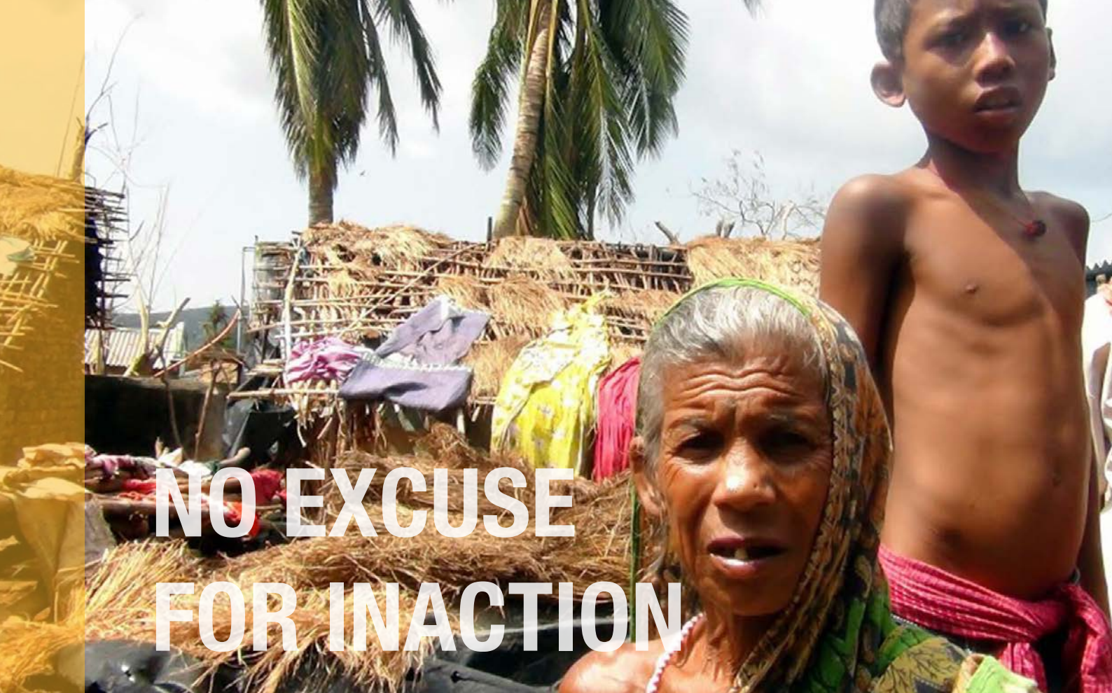
Cyclone Phailin, which hit eastern India in October 2013, destroyed countless buildings, forcing people to abandon their homes and move in with host families. Children and the elderly were particularly badly affected according to CARE aid workers on the ground.