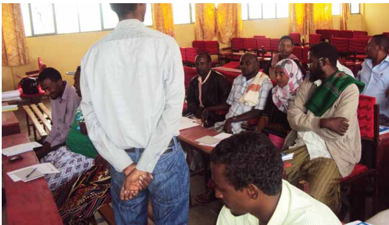
Training on climate change with Wereda officials in Chifra wereda

Climate-change impacts, vulnerability and adaptive capacity are location-specific and will change over time, but the processes needed for adaptations that support the most vulnerable will remain the same. Strengthening national level capacity is important, and progress has already been made in Ethiopia in developing national adaptation and risk-management frameworks, and regional and sectoral adaptation plans. However, national frameworks are only one piece of the puzzle. Community involvement in the design and implementation of adaptation strategies, taking due account of local issues, is another. The Environmental Protection Authority (EPA) recognises that wereda bureaus have a key role to play in ensuring community engagement, but acknowledges that efforts to realise this have not yet been adequately resourced. Wereda bureaus must be empowered to play a more active role in planning, and linking the bottom-up and top-down processes.